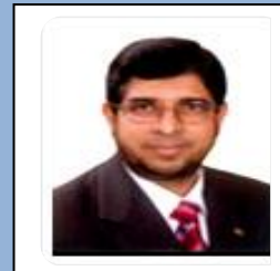
CEO, EXIM BANK